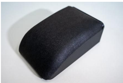
Concept model designed for use as an armrest, exhibited at the Automotive Engineering Exposition 2026 NAGOYA.

The concept armrest was developed by combining Meloop-based forming technologies and BASF's material. Wacoal is examining the possibility of applications in the field of automotive components from the perspectives of the technology's facilitation of lightweight products, the degree of freedom in the design process, and recyclability. Wacoal positions the exhibition as an example of its development of applications centered around the Meloop technology.