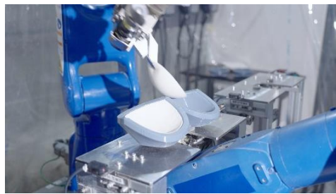
A bra cup production process using Meloop, showing fibers being sprayed onto a 3D-printed mold and then removed after forming.