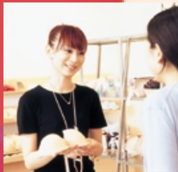
une nana cool